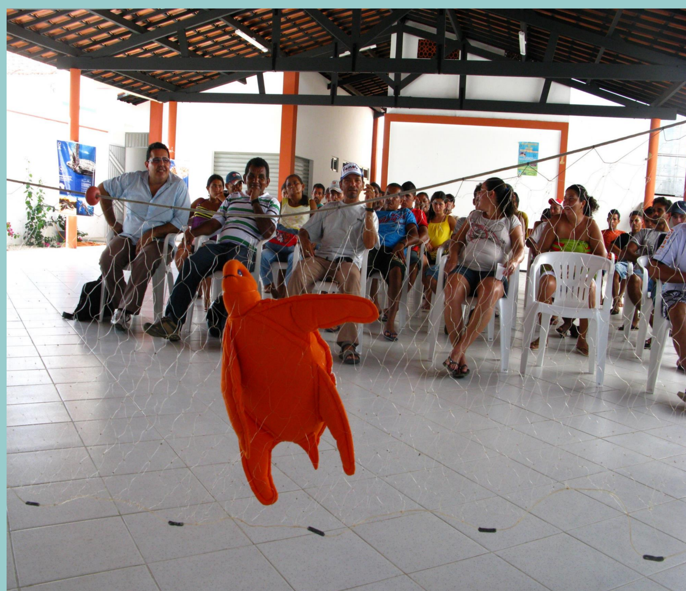
Figure 1: Theatrical performance of “Nets catch more than just fish” for fishermen and their relatives.

So far, eight presentations have already been done to 392 fishermen, who are close collaborators with Tamar on sea turtle Conservation activities. The play has also been held for the general public, as a means to raise awareness and engage people in the conservation process.