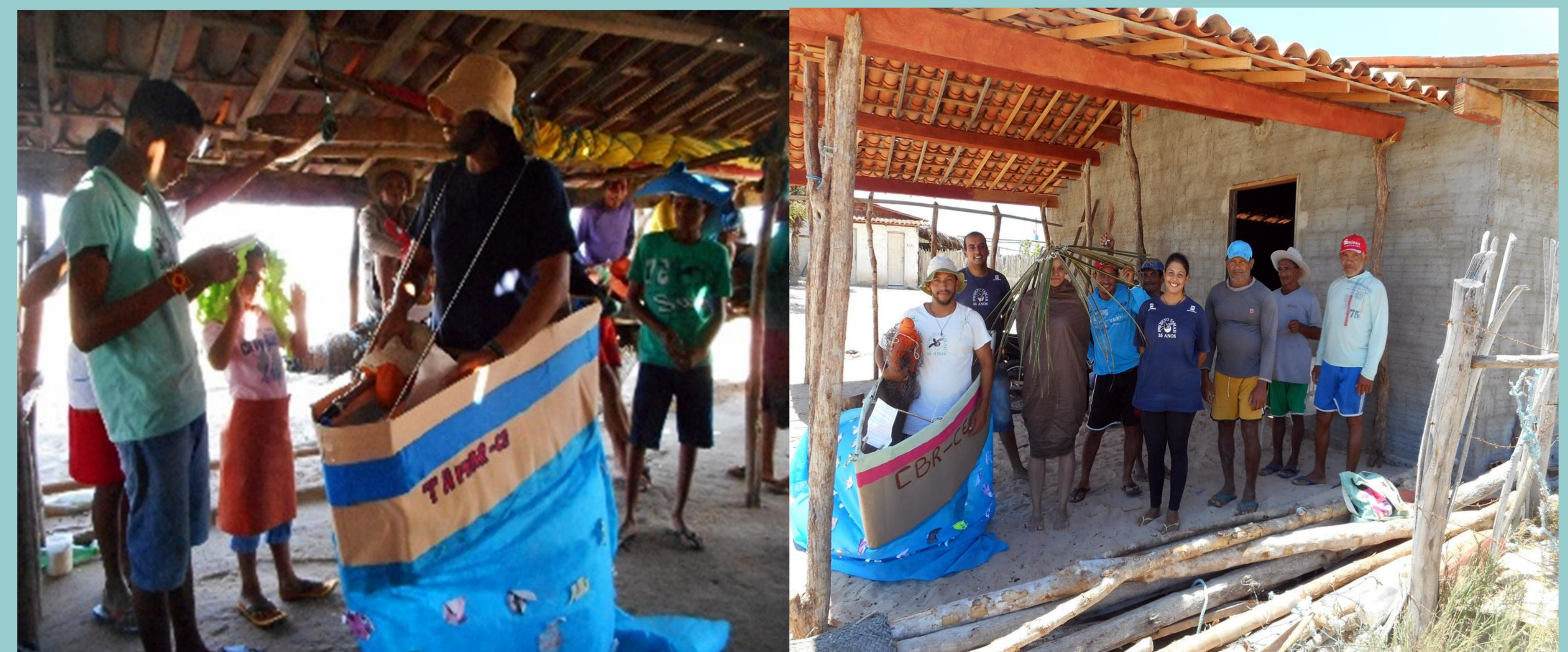
Figure 3: Theatrical performance of “Nets catch more than just fish” for fishermen, disclosing sea turtle resuscitation protocol for accidentally captured animals.

The Projeto Tamar Station in Almofala, at the West coast of the State of Ceará – Brazil, was established in 1993 to protect sea turtles and their feeding grounds along the area. Prior to its establishment, all sea turtles captured in fish corrals – a regional fishing method developed by Tremembé’s indigenous community – were killed and their products were sold locally. Once the project started its activities, it developed environmental education programs at local schools and encouraged community involvement through income generation activities. Since then, TAMAR has been carrying out the campaign “Nets catch more than just fish”, which aims to engage fishermen in sea turtle conservation.