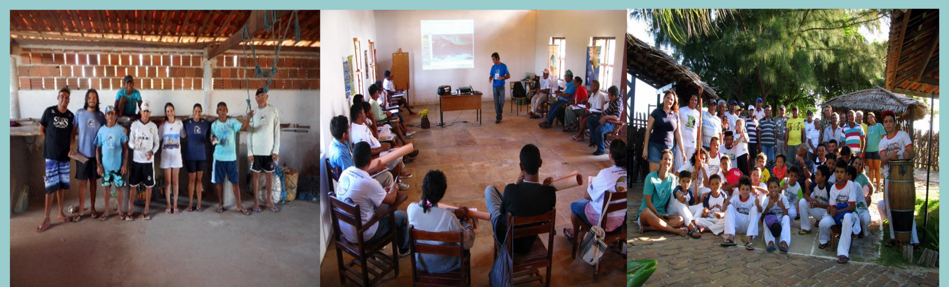
Figure 4: Groups of fishermen, who are close collaborators with TAMAR on regional sea turtle conservation activities.