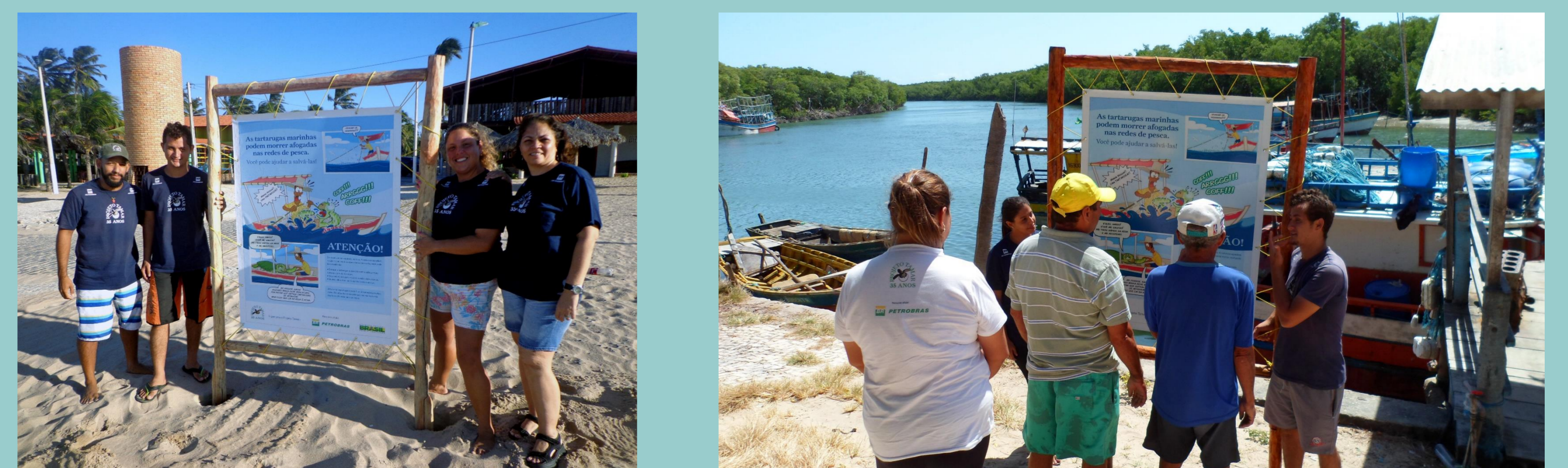
Figure 5: Campaign posters being placed at key points to increase awareness of sea turtle conservation within fishing communities.

The results have been really encouraging. Fishing communities have proven to be sensitive to sea turtle conservation and the theater has been considered a great success, since it helps addressing in a playful and dynamic way, a very serious conservation problem. Many fishermen have become greatly engaged with environmental issues, such as responsible fisheries and regional sea turtle conservation activities.